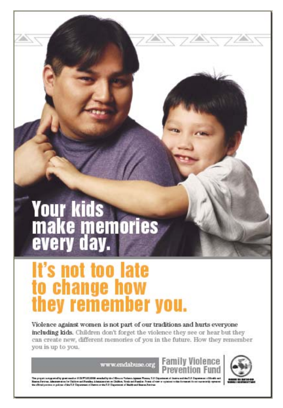
FAV Poster, created in collaboration with Mending the Sacred Hoop

oppressive dominant culture. If, on the other hand, a center reflects the diversity of the communities it serves throughout its structure and philosophy, and the staff are skillful at using culture as a tool of engagement, the chances of creating a meaningful connection and enforcing effective accountability will significantly increase.